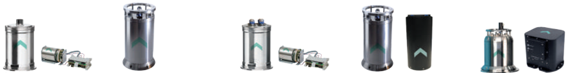
Octans Nano / OEM

Exail's Inertial Navigation Systems (INS) equip over 80% of the subsea vehicles used in the Energy industry. Based on Exail's Fiber-Optic Gyroscope (FOG) technology, they are robust and maintenance-free systems that offer unrivaled performance. In addition, Exail partners with Doppler Velocity Log (DVL) manufacturers to offer a solution in which users are able to choose the optimum solution for their project without compromising on performance.